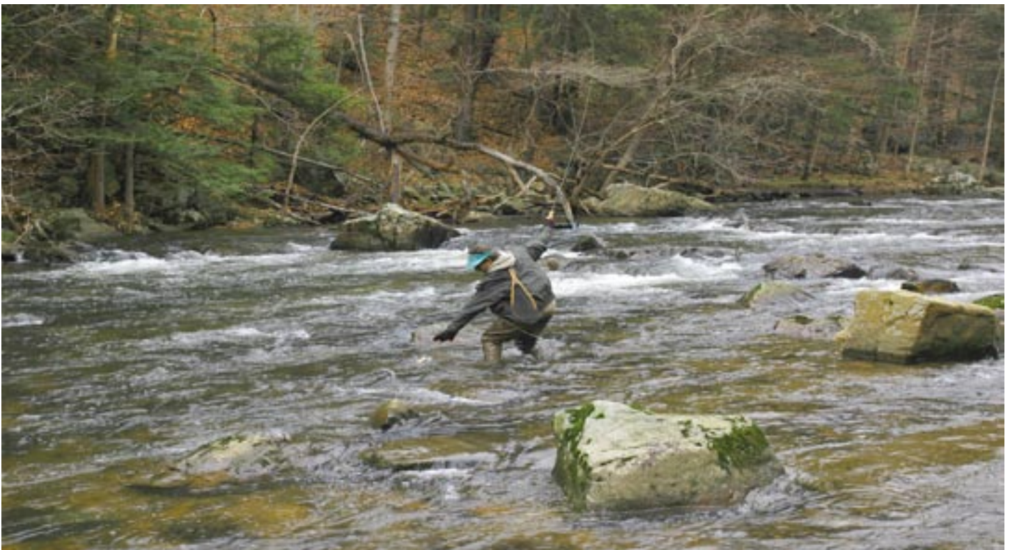
Winter fishing in Ken Lockwood Gorge can still be quite productive.